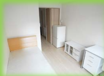
Each dormitory room is a single-person unit with private shower/bathroom

Housing is an essential, and perhaps the primary issue when deciding about where to study at home or abroad. Rikkyo University housing aims to provide students a place to develop a community of friends in a convenient location to campus and in a safe environment to make residents feel secure and comfortable. Housing in Tokyo can be daunting, but Rikkyo University is here to help.